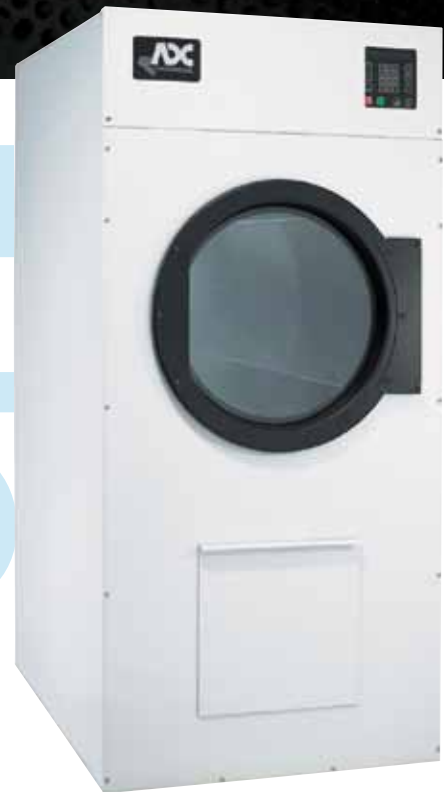
AD-50V OPL Dryer