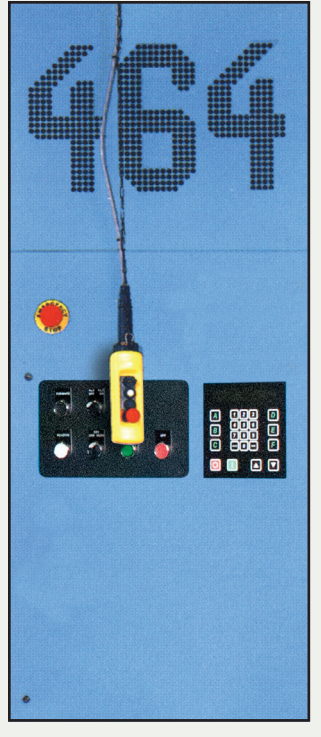
Front Control Panel